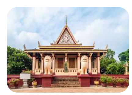
Wat Phnom Temple